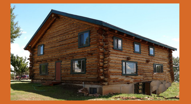
Work week will be May 11-16th

We are always looking to improve CBX. These days, most of our time is spent fixing and repairing things that have worn out over the years! This past summer, we took down the old rotten back deck of Alpine Lodge and will be replacing it with a covered deck that wraps around the side and back of the builling. If you are interested in helping with the rebuild, we will begin the work this winter and then tackle the majority of the project this work week with the help of the TXS Baptist Men and our friends up at Bear Valley Church! We are also looking for sponsors for the building materials. If you would like to contribute this way, you can send a gift to CBX with a notation stating the Alpine Deck Project.